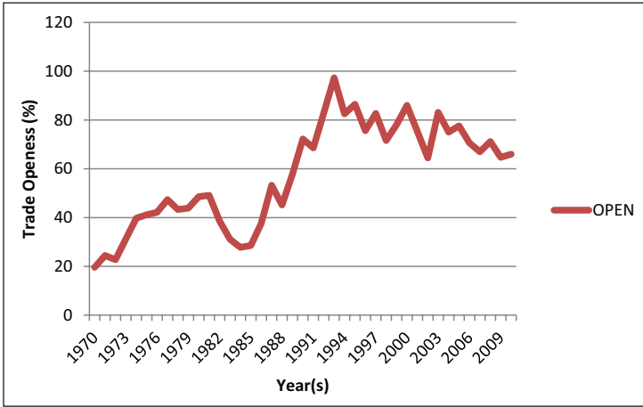
Figure 2. Trade openness measure (1970–2010). OPEN: trade openness measure, as defined in text.